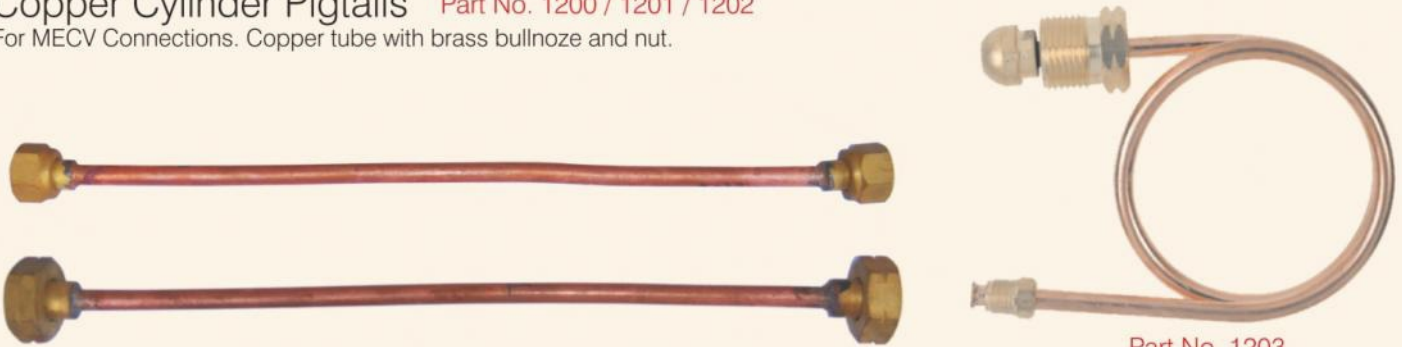
Part No. 1203

For MECV Connections. Copper tube with brass bullnoze and nut.