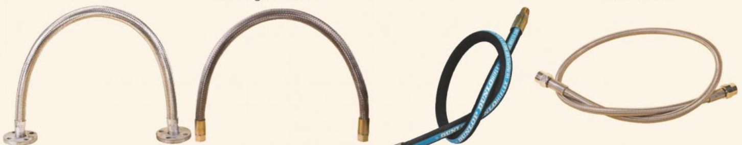
Part No. 1245A