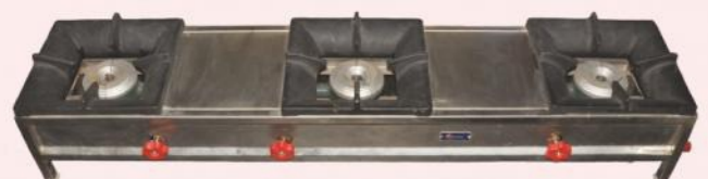
Commercial 3 Burner Stove Table Top Model