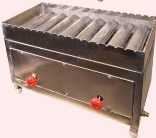
Table Top Model fabricated in SS frame and tank with SS drip basket for frying as per customer specifications.