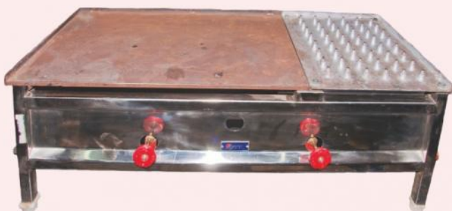
Commercial Chapati Plate Table Top Model

Made as per customer specification in SS body and frame with ceramic or SS mesh burners.